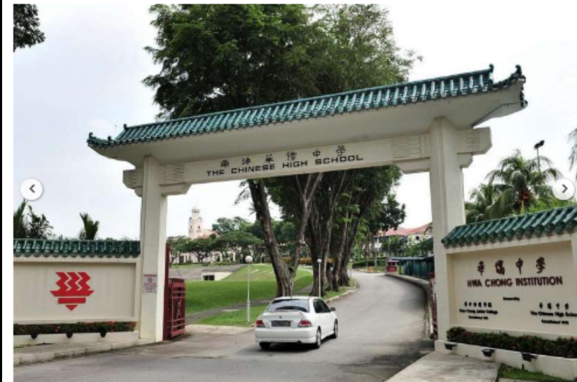
1 of 2 Former students of Hwa Chong Institution have started a petition on Wednesday calling for the school to suspend a sexuality education workshop offered by Focus On The Family Singapore.

Former HCI students want school to suspend sexuality education workshop