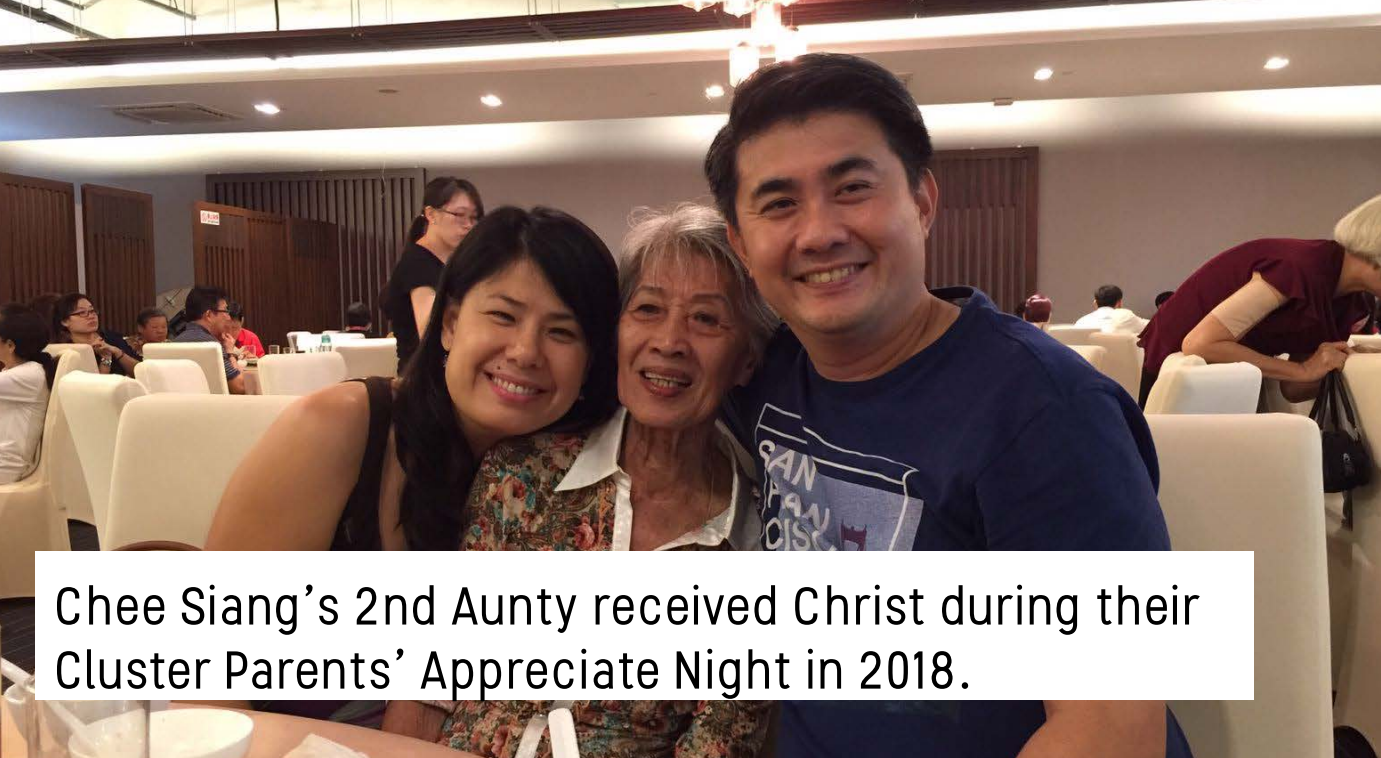
Chee Siang's 2nd Aunty received Christ during their Cluster Parents' Appreciate Night in 2018.