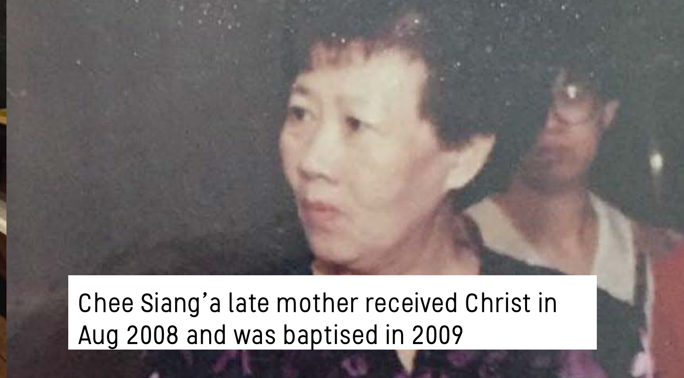
Chee Siang's late mother received Christ in Aug 2008 and was baptised in 2009