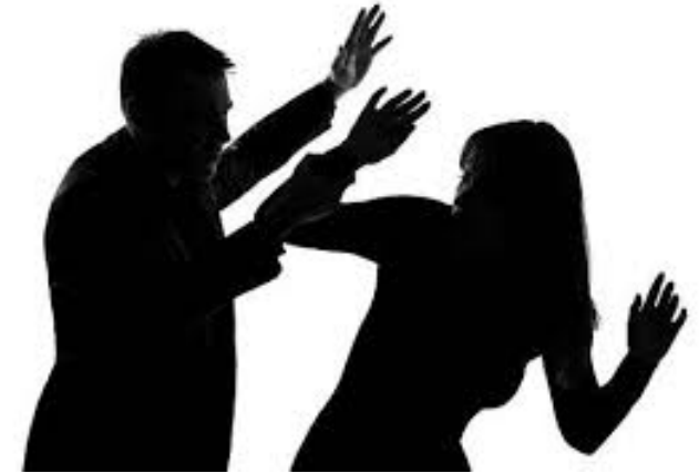
Committed Crime again