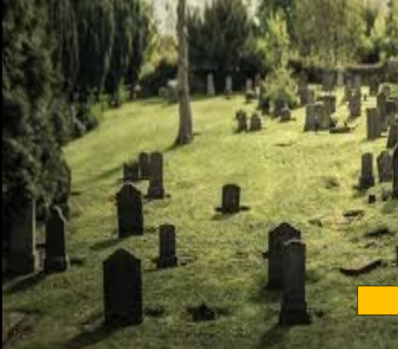
Gadara Past narrative