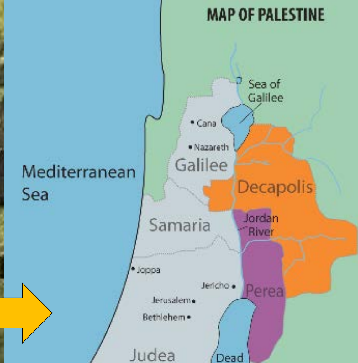
Decapolis New narrative