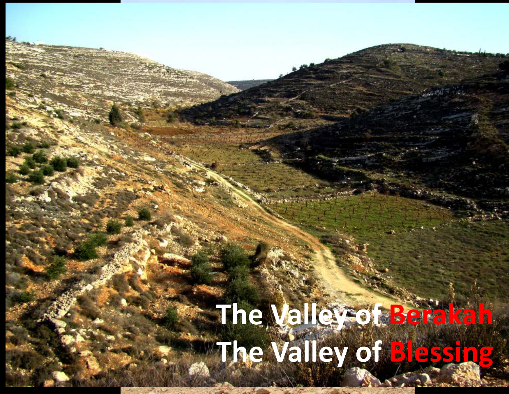
The Valley of Berakah The Valley of Blessing

24 When the men of Judah came to the place that overlooks the desert and looked toward the vast army, they saw only dead bodies lying on the ground; no one had escaped. 25 So Jehoshaphat and his men went to carry off their plunder, and they found among them a great amount of equipment and clothing [d] and also articles of value—more than they could take away. There was so much plunder that it took three days to collect it. 26 On the fourth day they assembled in the Valley of Berakah, where they praised the Lord. This is why it is called the Valley of Berakah [e] to this day.