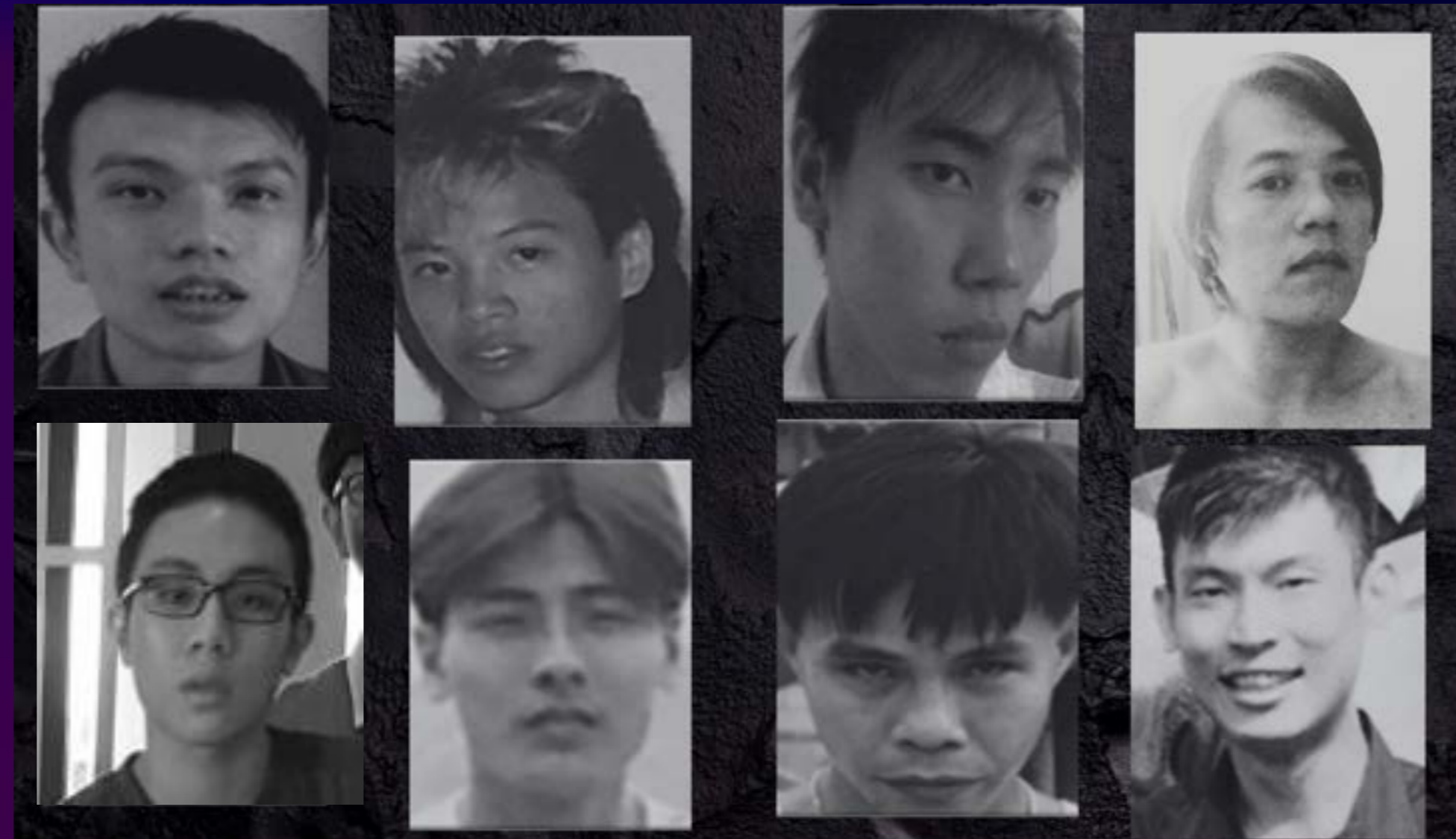
These men once lived troubled lives as rioters, gangsters and offenders.