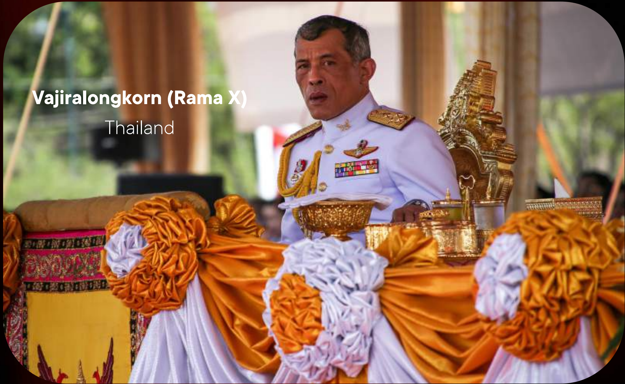
Vajiralongkorn (Rama X) Thailand