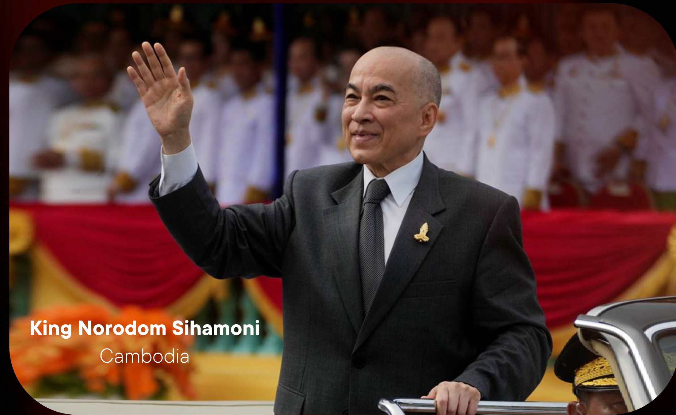
King Norodom Sihamoni Cambodia