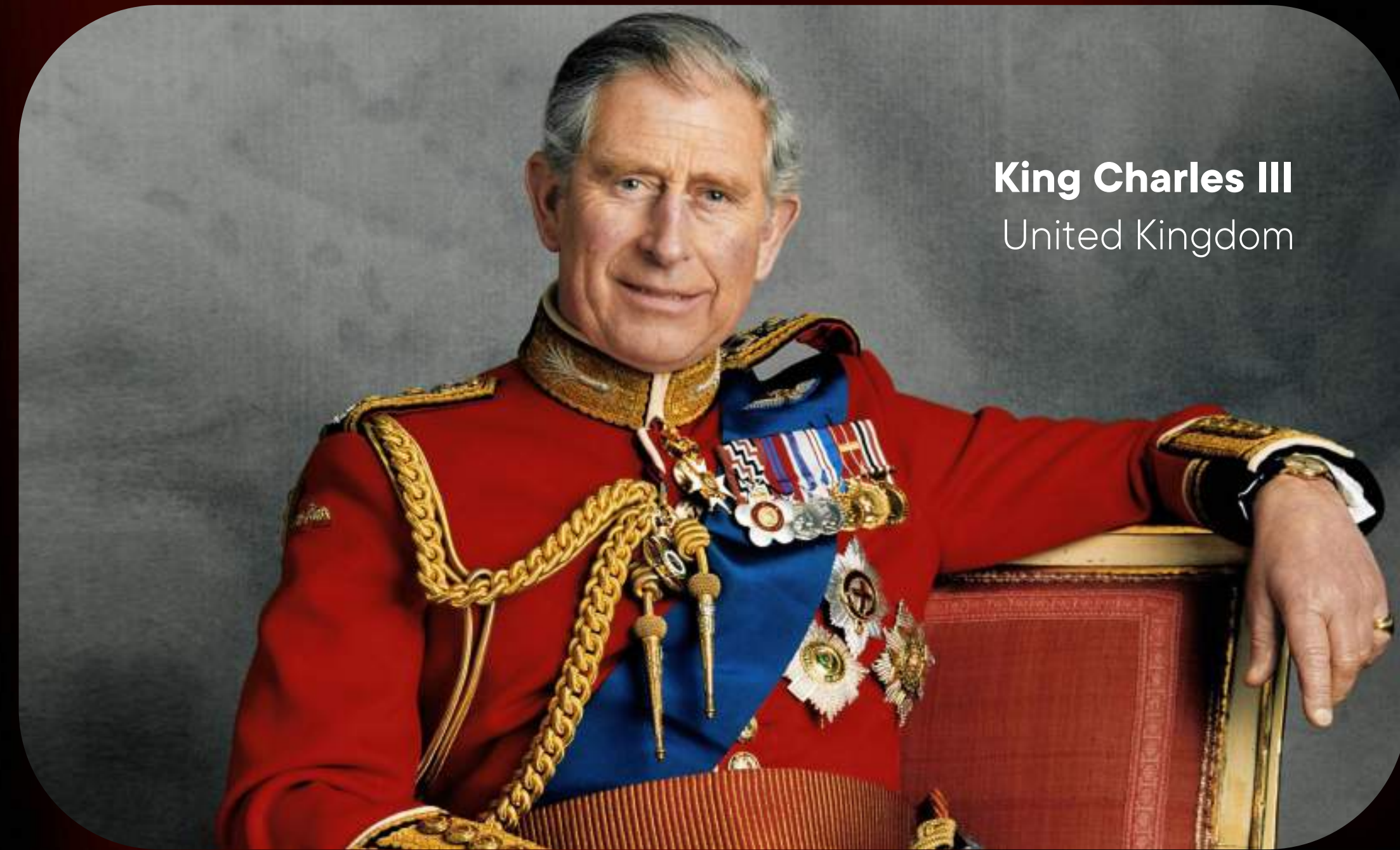
King Charles III United Kingdom